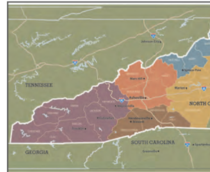
Assess Food Systems